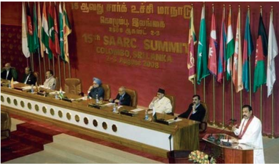
Head of States of SAARC Nations at the 15th SAARC Summit in Colombo.

For the SRFB to have any real meaning it is important for food surplus countries to provide some small amount as aid to food deficit nations within the region. The gesture could have tremendous impact internationally by demonstrating that the region was taking measures on its own to feed its own people, when especially the developed nations have been justifying their food surpluses to feed the developing countries. This could have sent a tremendous political message internationally and could also influence the South Asian negotiations strategy in agriculture in international flora.