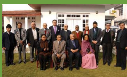
Board Members at the 7th Board Meeting SA-CEPS Secretariat, Kathmandu on 1st Feb, 2008.

THE BIENNIAL NEWSLETTER OF THE SOUTH ASIA CENTRE FOR POLICY STUDIES.