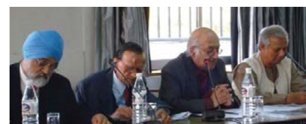
From Left to Right: Dr. Montek Singh Ahluwalia, Prof. Muchkund Dubey, Prof. Rehman Sobhan and Prof. Muhammad Yunus at IIC in New Delhi.

problems cannot be solved with 20th Century thought process." If South Asia is to succeed in dealing the rapid pace of change in the world today it must also be able to adapt to the changes. First, all our thinking process has to be projected at least 20 years ahead so that we can move in a direction that we have targeted. And second, as it is already evidenced in some cases, people will be moving much faster ahead than governments. "Governments will have to run after people so that they don't become redundant." And it is the younger generation who will lead the way.