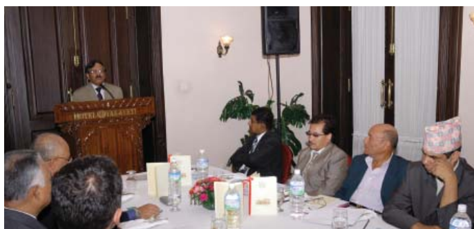
SAARC Secretary General H.E. Dr. Sheel Kant Sharma addressing the gathering in Kathmandu.

In order to formally present SACEPS' Recommendations to the 15th SAARC Summit, a luncheon meeting with the SAARC Secretary General, Ambassadors of SAARC member states and observer countries stationed in Nepal was organized at Yak and Yeti Hotel, in Kathmandu, on 14th July 2008. The key areas covered in the recommendations include the